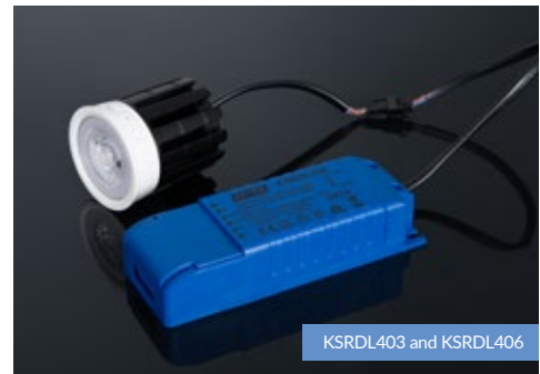
KSRDL403 and KSRDL406